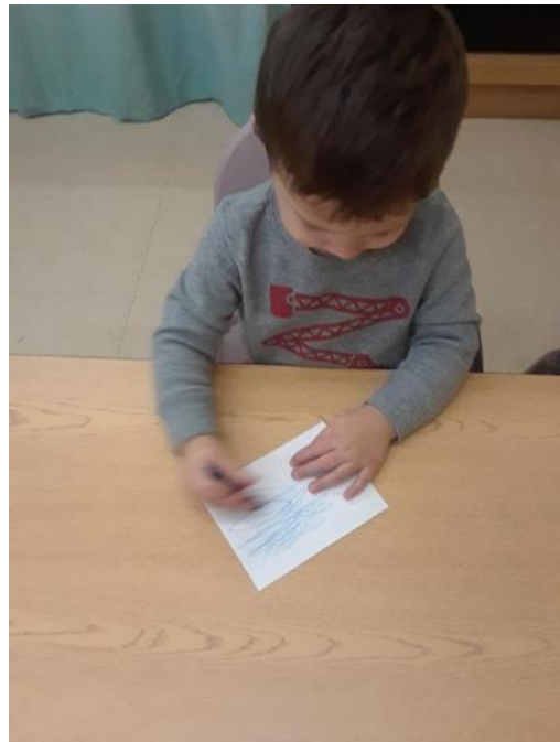
Beckham and Jack coloring a winter picture.