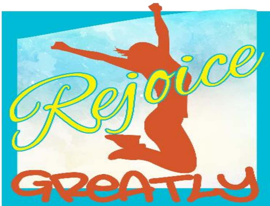
Image: “Rejoice greatly, O daughter of Zion! Shout aloud, O daughter of Jerusalem!” (Zechariah 9:9)