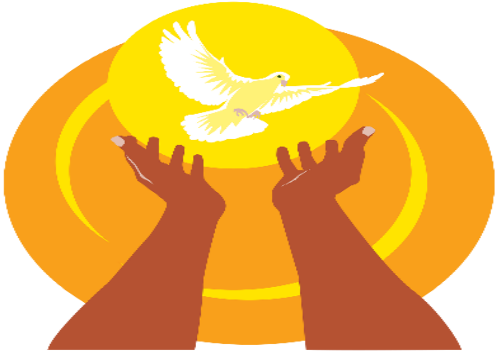
Image: “Do you not know that your body is a temple of the Holy Spirit within you, whom you have from God? You are not your own, for you were bought with a price. So glorify God in your body.” (1 Corinthians 6:19–20)