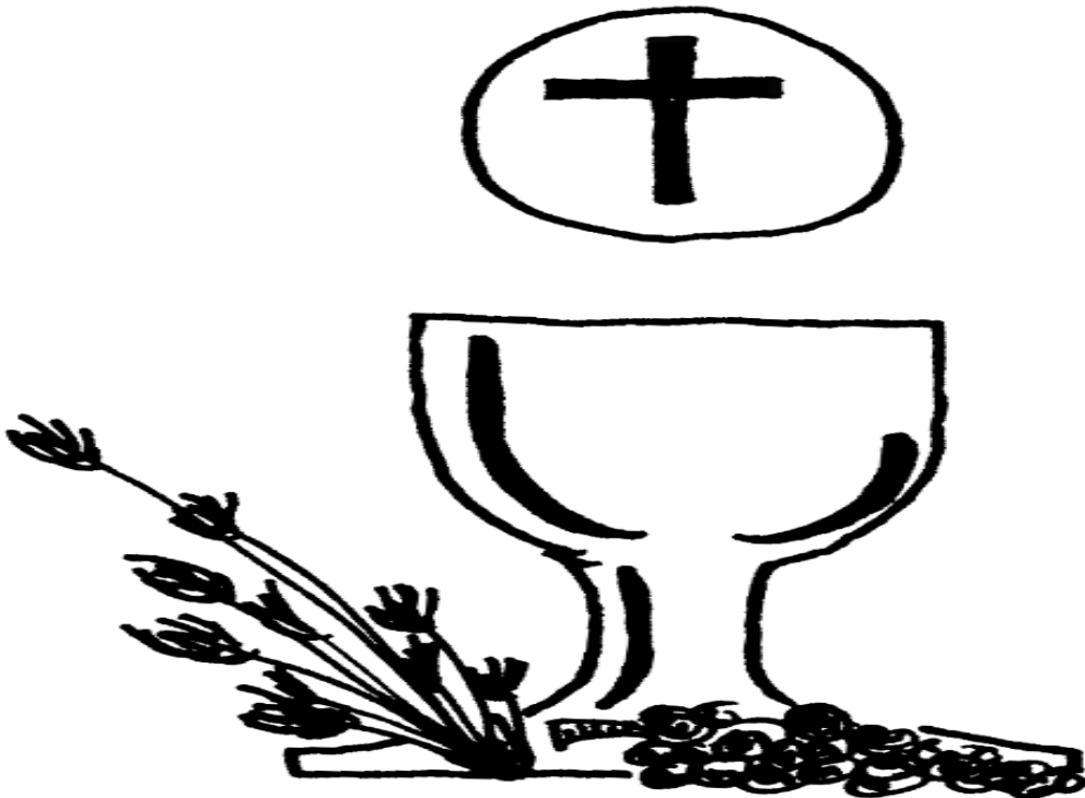
Image: “... 23 For I received from the Lord what I also delivered to you, that the Lord Jesus on the night when he was betrayed took bread, 24 and when he had given thanks, he broke it, and said, “This is my body which is for you. Do this in remembrance of me.” 25 In the same way also he took the cup, after supper, saying, “This cup is the new covenant in my blood. Do this, as often as you drink it, in remembrance of me.” 26 For as often as you eat this bread and drink the cup, you proclaim the Lord’s death until he comes.” (1 Corinthians 11:23-26)