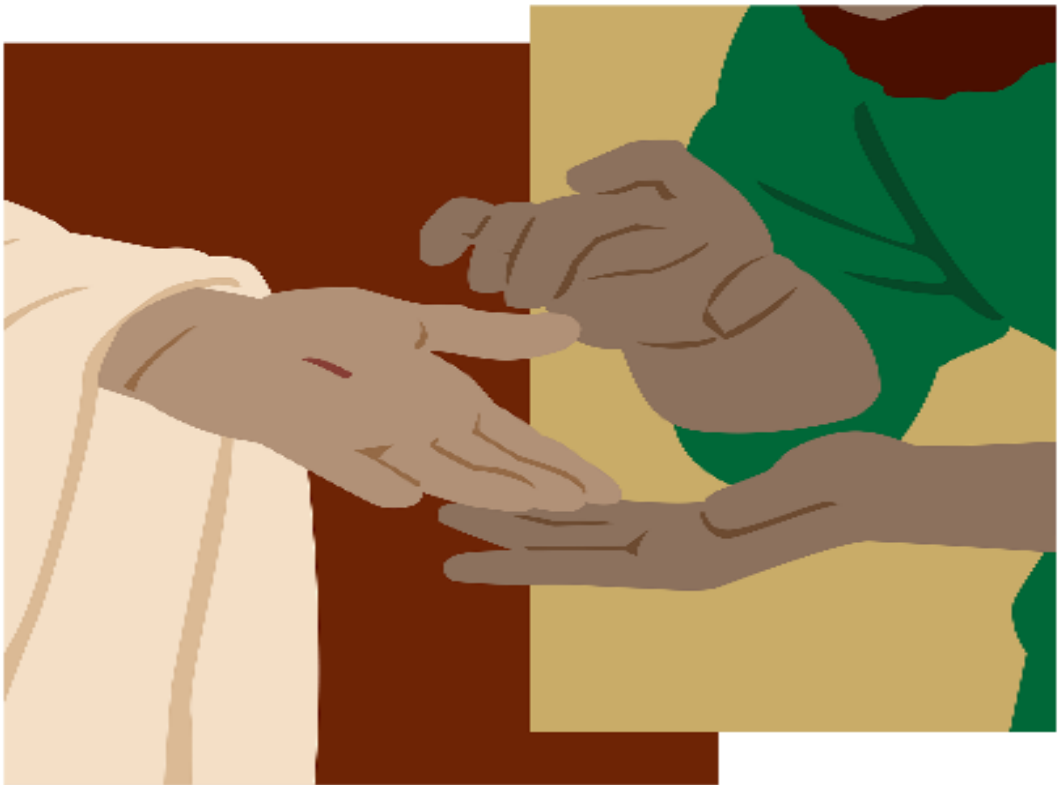
Image: “He said to Thomas, “Put your finger here, and see My hands; and put out your hand, and place it in My side. Do not disbelieve, but believe.” Thomas answered Him, “My Lord and my God!” (John 20:27-28)