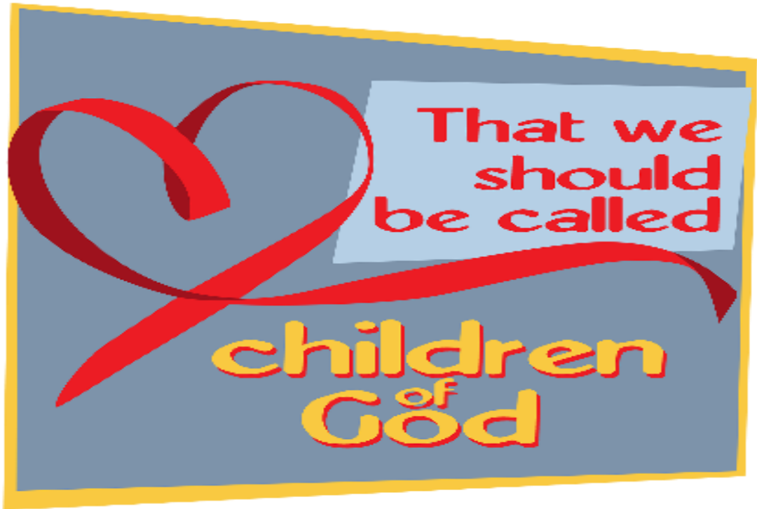
Image: “See what kind of love the Father has given to us, that we should be called children of God; and so we are.” (1 John 3:1)