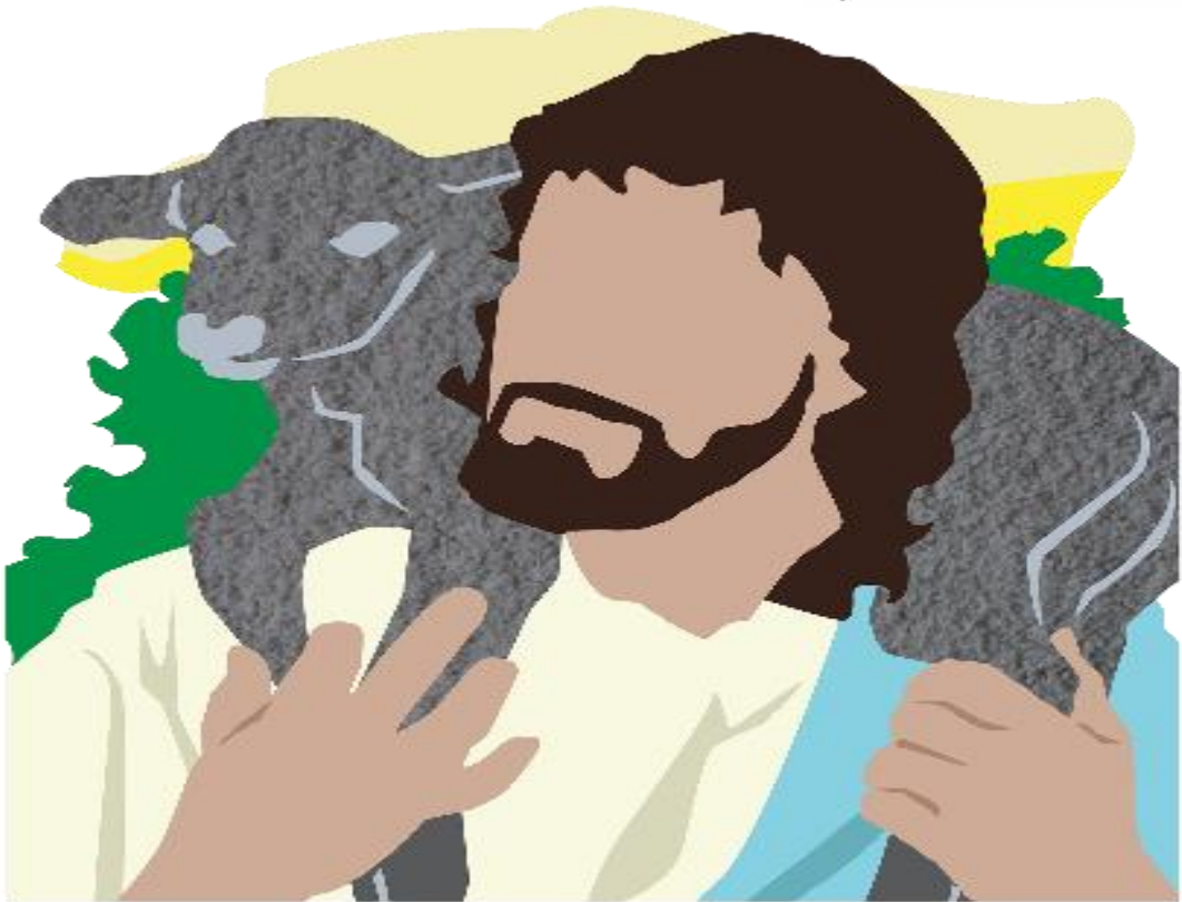
Image: “I am the good shepherd. I know My own and My own know Me, just as the Father knows Me and I know the Father; and I lay down My life for the sheep.” (John 10:14-15)