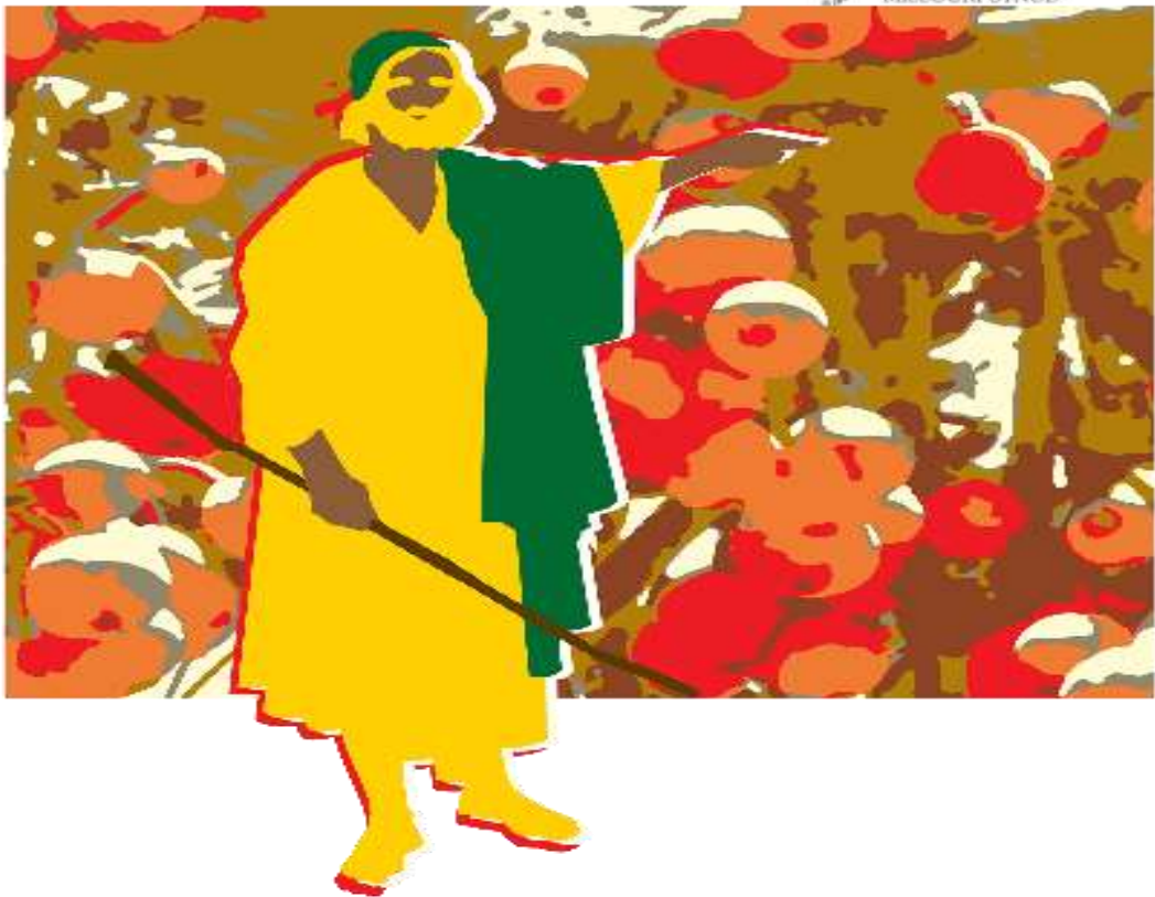
Image: "Then Amos answered and said to Amaziah, 'I was no prophet, nor a prophet's son, but I was a herdsman and a dresser of sycamore figs.'" (Amos 7:14)