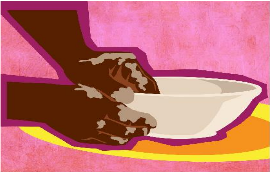
Image: "Shall the potter be regarded as the clay, that the thing made should say of its maker, 'He did not make me'; or the thing formed say of him who formed it, 'He has no understanding?'" (Isaiah 29:6)