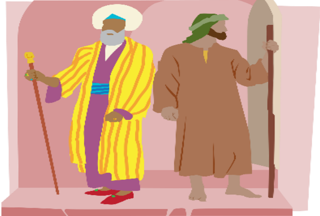
Image: "My brothers, show no partiality as you hold the faith in our Lord Jesus Christ, the Lord of glory. For if a man wearing a gold ring and fine clothing comes into your assembly, and a poor man in shabby clothing also comes in, and if you pay attention to the one who wears the fine clothing and say, "You sit here in a good place," while you say to the poor man, "You stand over there," or, "Sit down at my feet," have you not then made distinctions among yourselves and become judges with evil thoughts?" (James 2:1-4)