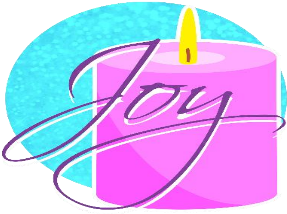
Image: “Rejoice in the Lord always; again I will say, Rejoice.” ( Philippians 4:4 )