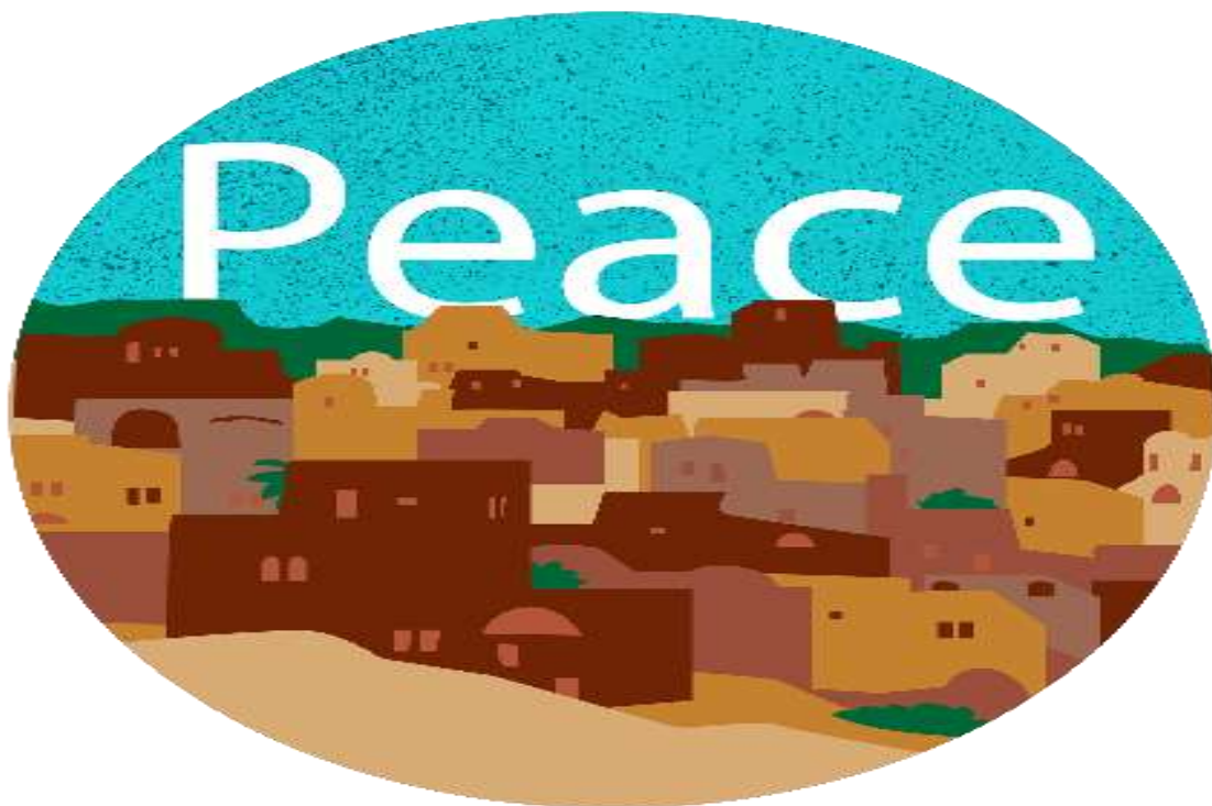
Image: “And He shall stand and shepherd His flock in the strength of the LORD, in the majesty of the name of the LORD His God. And they shall dwell secure, for now He shall be great to the ends of the earth. And He shall be their peace.” ( Micah 5:4-5a )