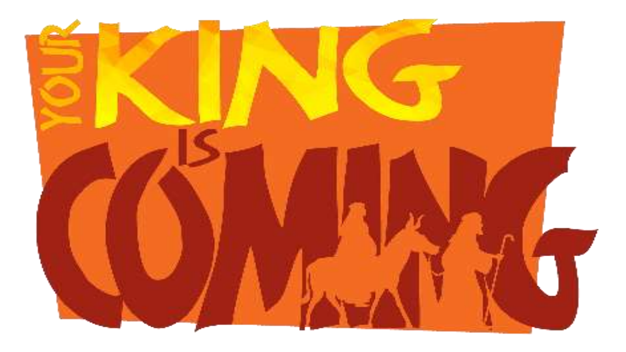
Image: "Behold, your king is coming to you; righteous and having salvation is He. (Zechariah 9:9)