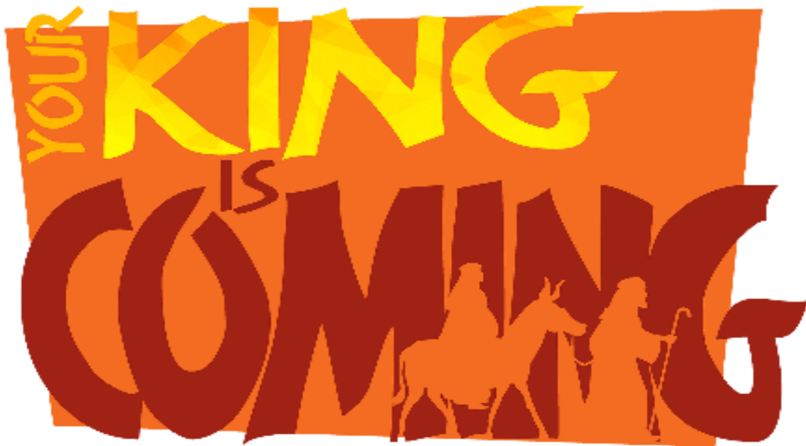
Image: “Behold, your king is coming to you; righteous and having salvation is He. (Zechariah 9:9)