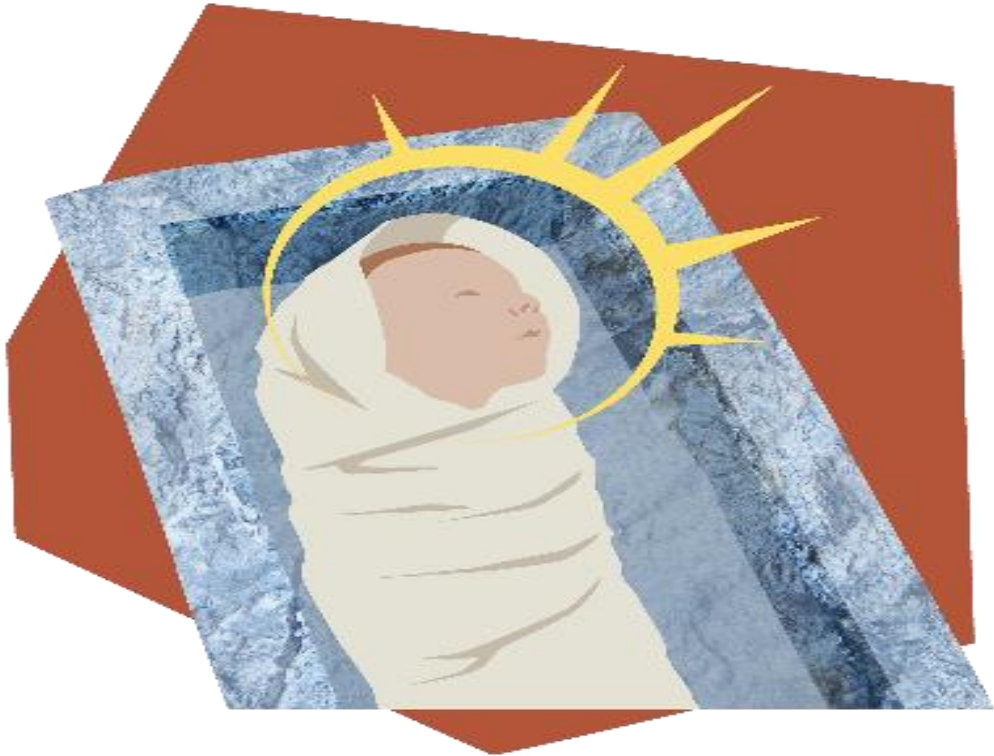
Image: “The Word became flesh and dwelt among us, and we have seen His glory, glory as of the only Son from the Father, full of grace and truth.” (John 1:14)