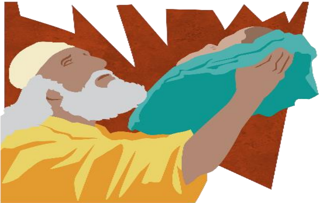
Image: “And he [Simeon] came in the Spirit into the temple, and when the parents brought in the child Jesus, to do for Him according to the custom of the Law, he took Him up in his arms and blessed God.” (Luke 2:27–28)