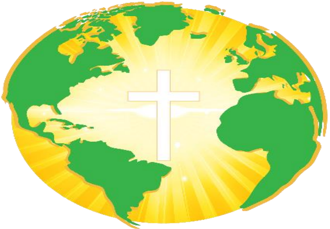
Image: "Holy, holy, holy is the LORD of hosts; the whole earth is full of His glory!" (Isaiah 6:3)