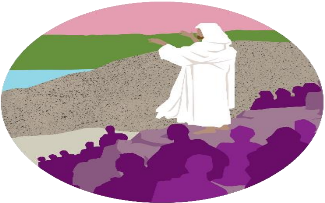
Image: "And He came down with them and stood on a level place, with a great crowd of His disciples and a great multitude of people from all Judea and Jerusalem and the seacoast of Tyre and Sidon, who came to hear Him and to be healed of their diseases. And those who were troubled with unclean spirits were cured. And all the crowd sought to touch Him, for power came out from Him and healed them all." (Luke 6:17-19)