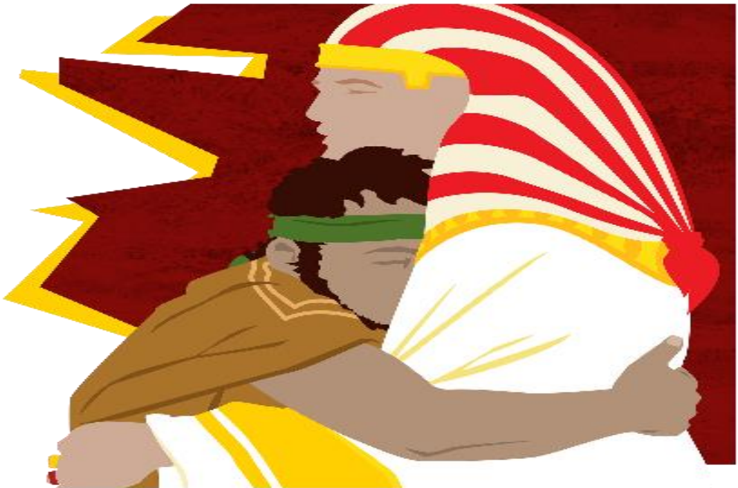
Image: "But love your enemies, and do good, and lend, expecting nothing in return, and your reward will be great, and you will be sons of the Most High, for He is kind to the ungrateful and the evil. Be merciful, even as your Father is merciful." (Luke 6:35-36)