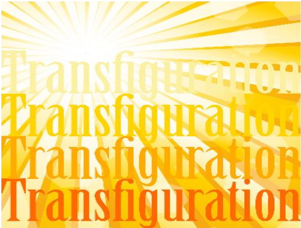
Image: "O wondrous type! O vision fair Of glory that the Church may share, Which Christ upon the mountain shows, Where brighter than the sun He glows! (LSB 413:1)