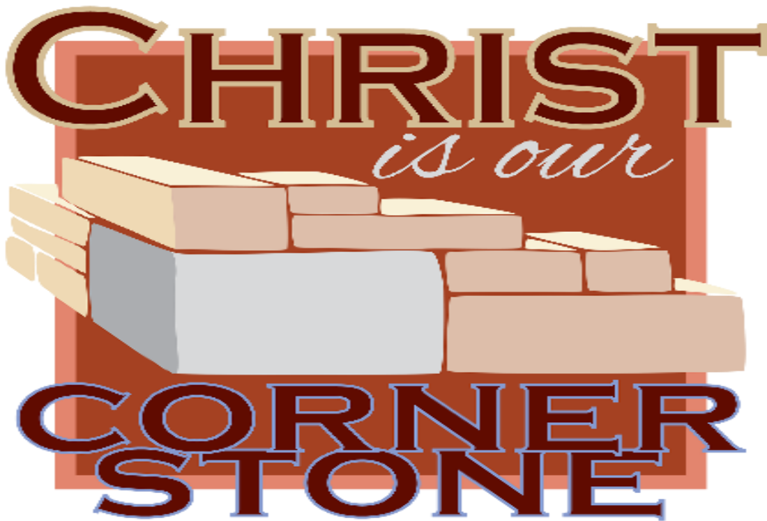
Image: "Christ is our cornerstone, On Him alone we build; With His true saints alone The courts of heav'n are filled. On His great love Our hopes we place Of present grace And joys above." (LSB 912:1)