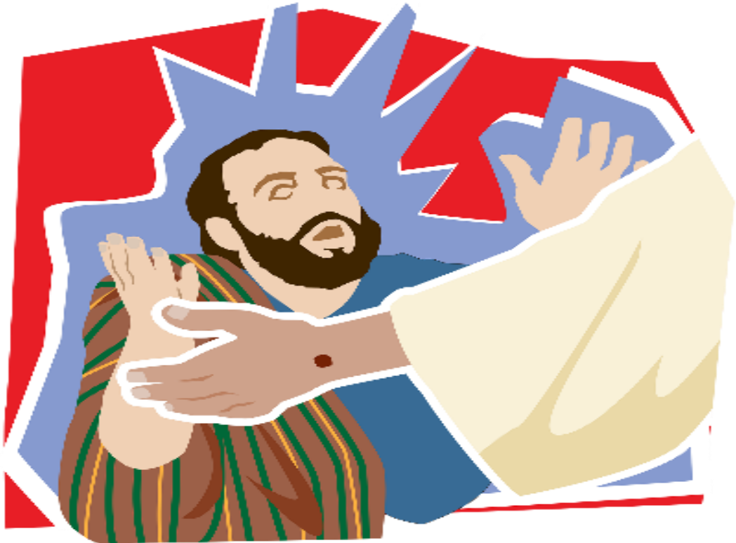
Image: "No longer Thomas then denied; He saw the feet, the hands, the side; "You are my Lord and God!" he cried. Alleluia, alleluia, alleluia!" (LSB 470:7)