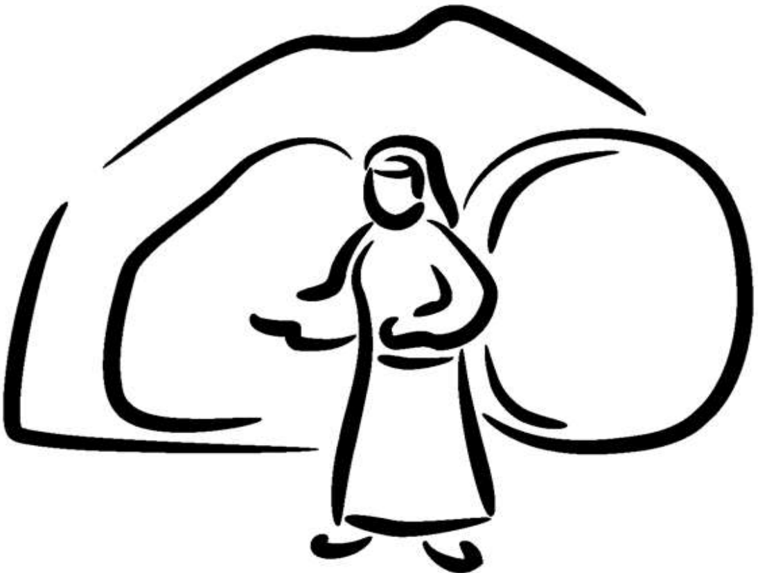
Image: "Now of the first day of the week Mary Magdalene came to the tomb early, while it was still dark, and saw that the stone had been taken away from the tomb . . . she turned around and saw Jesus, but she did not know that it was Jesus." (John 20:1 and 4)