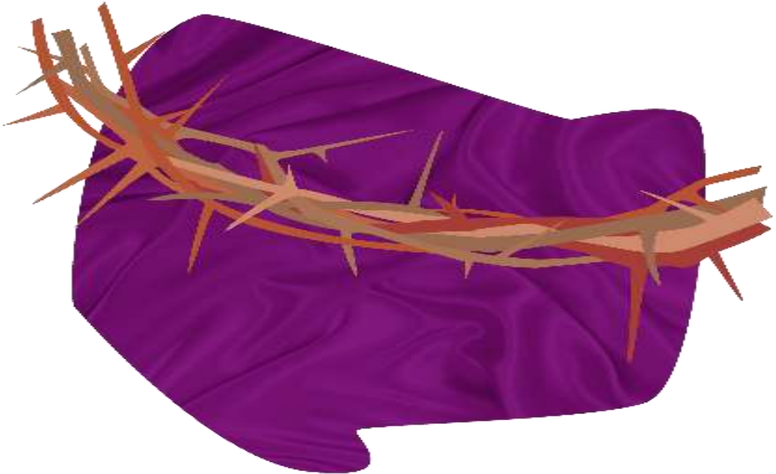
Image: "Return to the LORD your God, for he is gracious and merciful, slow to anger, and abounding in steadfast love; and he relents over disaster." (Joel 2:13)