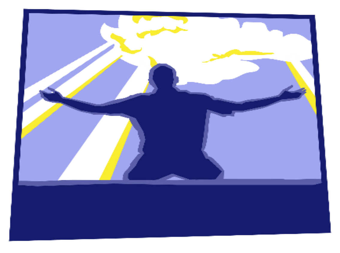
Image: "Through Him then let us continually offer up a sacrifice of praise to God, that is, the fruit of lips that acknowledge His name. Do not neglect to do good and to share what you have, for such sacrifices are pleasing to God." (Hebrews 13:15-16)