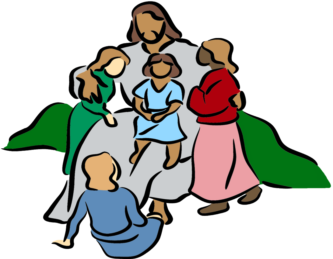
Image: "Let the children come to Me, and do not hinder them, for to such belongs the kingdom of God." (Luke 18:16)