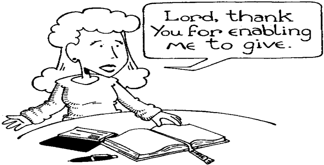
Image: "You will be made rich in every way so that you can be generous on every occasion, and through us your generosity will result in thanksgiving to God" (2 Corinthians 9:11).