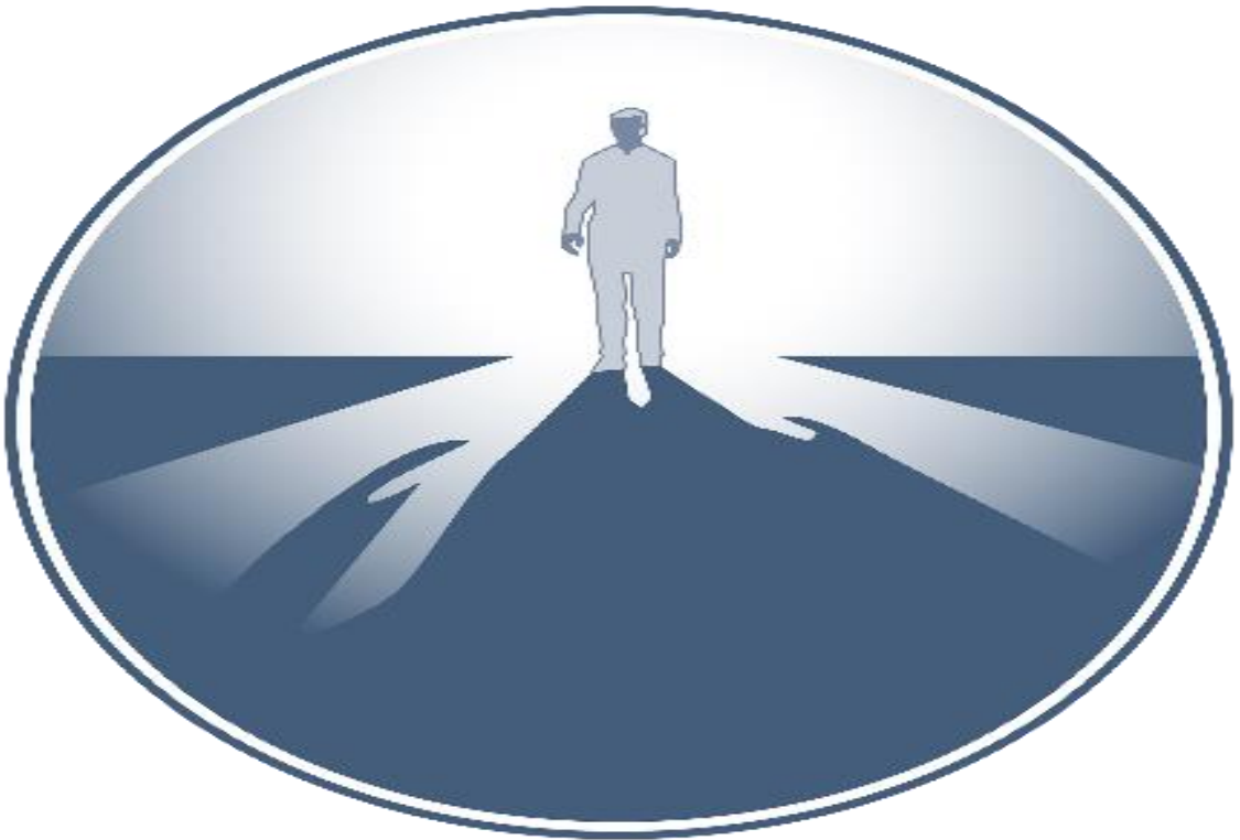
Image: "For at one time you were darkness, but now you are light in the Lord. Walk as children of light (for the fruit of light is found in all that is good and right and true), and try to discern what is pleasing to the Lord." ( Ephesians 5:8-10 )