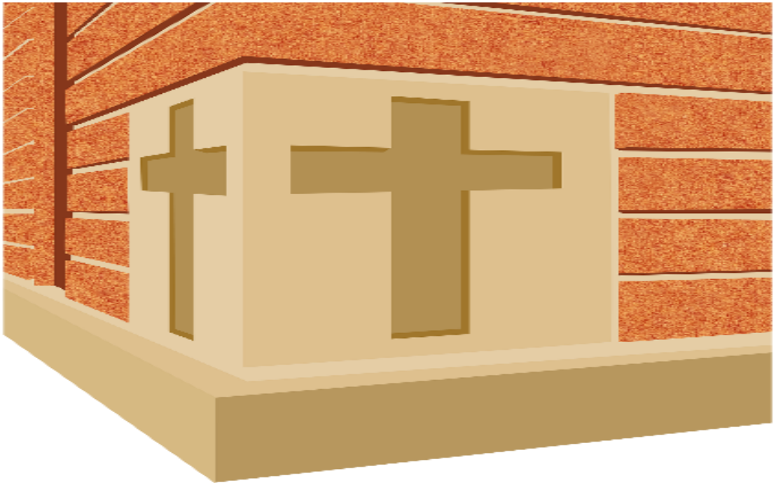
Image: "Christ is our cornerstone, On Him alone we build; With His true saints alone The courts of heav'n are filled. On His great love Our hopes we place Of present grace And joys above." (LSB 912:1)