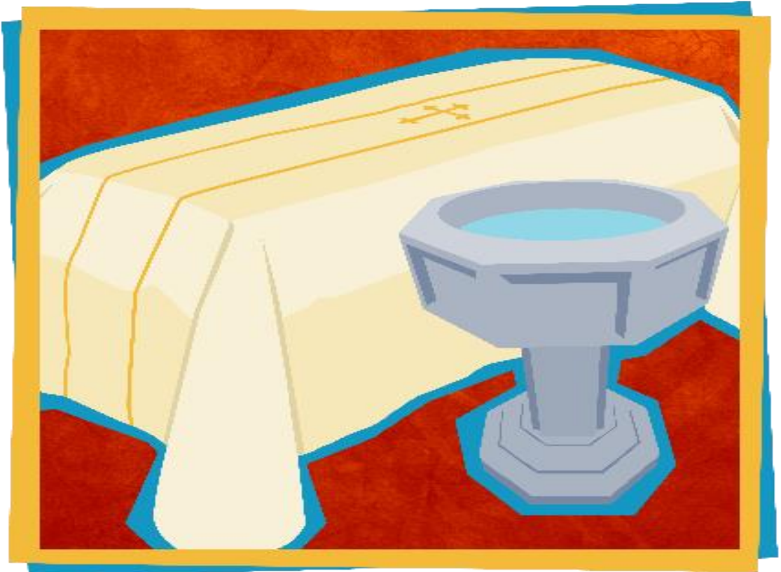
Image: "These are the ones coming out of the great tribulation. They have washed their robes and made them white in the blood of the Lamb." (Revelation 7:14b)