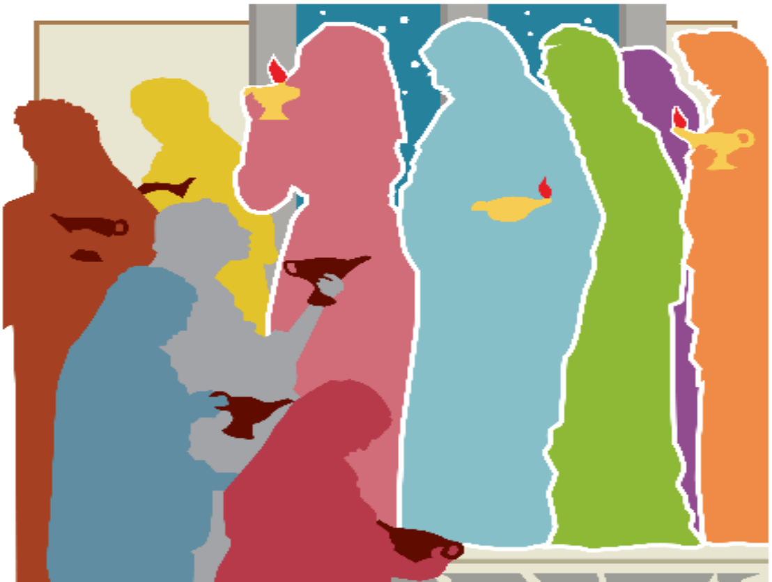
Image: "Watch therefore, for you know neither the day nor the hour." (Matthew 25:13)