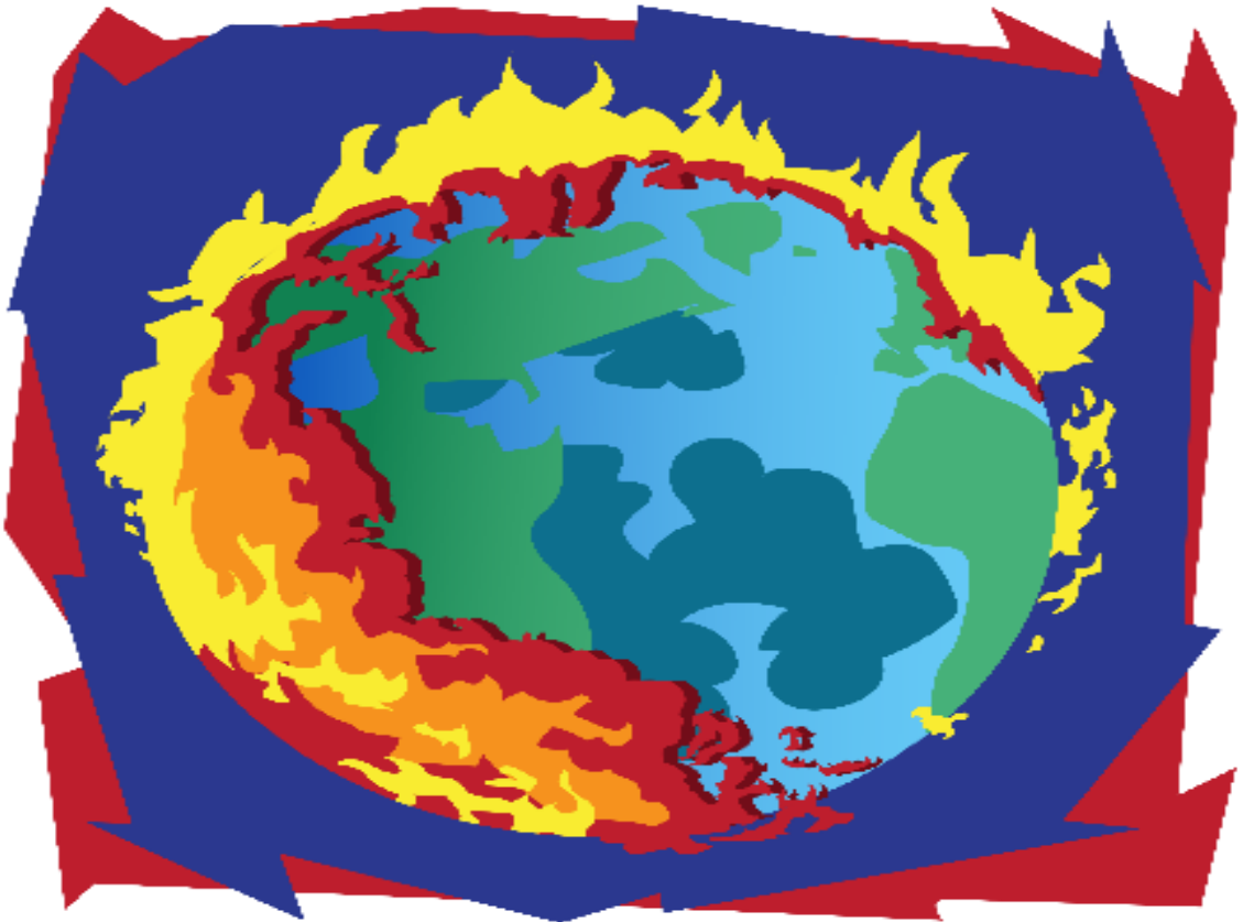
Image: "Day of wrath, O day of mourning! See fulfilled the prophet's warning, Heav'n and earth in ashes burning. To the rest Thou didst prepare me On Thy cross; O Christ, upbear me! Spare, O God, in mercy spare me!" (TLH 607:1, 19)