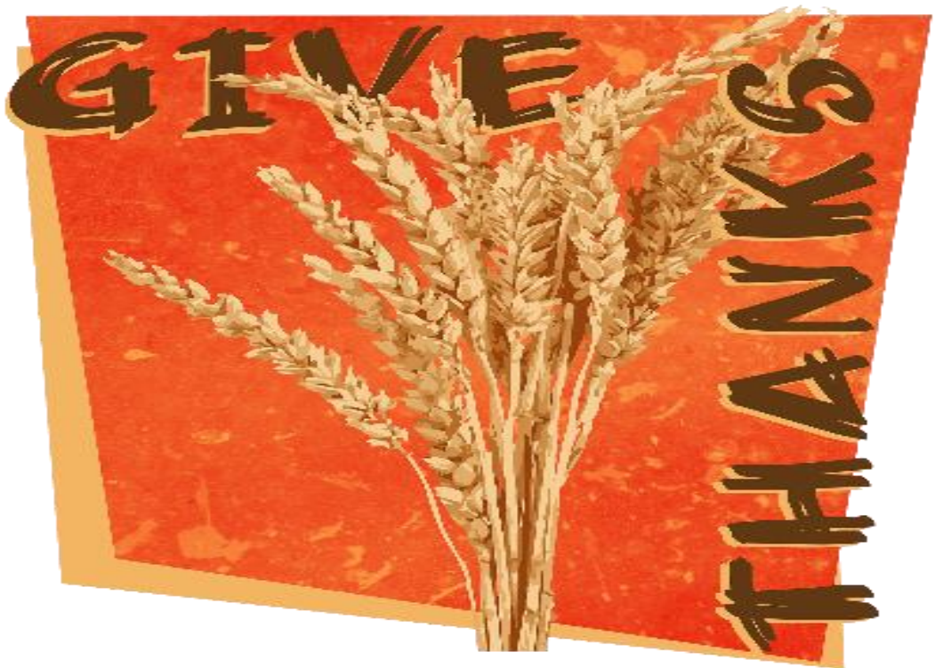
Image: “Give thanks to the LORD, for He is good, for His steadfast love endures forever.” (Psalm 136:1)