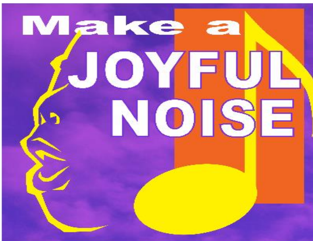
Image: "Oh come, let us sing to the LORD; let us make a joyful noise to the rock of our salvation! Let us come into His presence with thanksgiving; let us make a joyful noise to Him with songs of praise!" ( Psalm 95:1-2 )