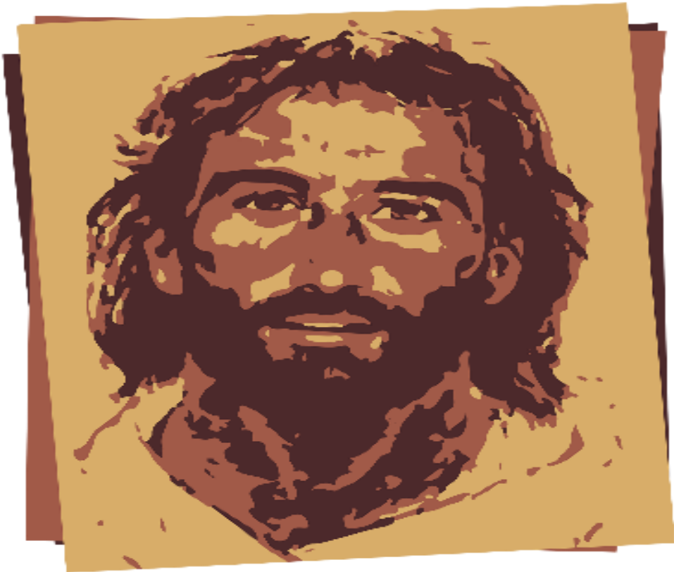
Image: “Jesus Christ, the son of David, the son of Abraham, . . . the father of Joseph the husband of Mary, of whom Jesus was born, who is called Christ.” ( Matthew 1:1, 16 )