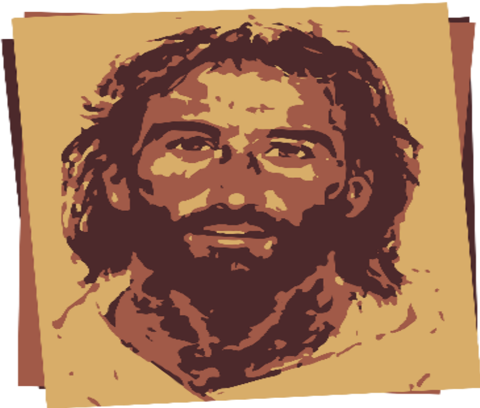
Image: “Jesus Christ, the son of David, the son of Abraham, . . . the father of Joseph the husband of Mary, of whom Jesus was born, who is called Christ.” ( Matthew 1:1, 16 )