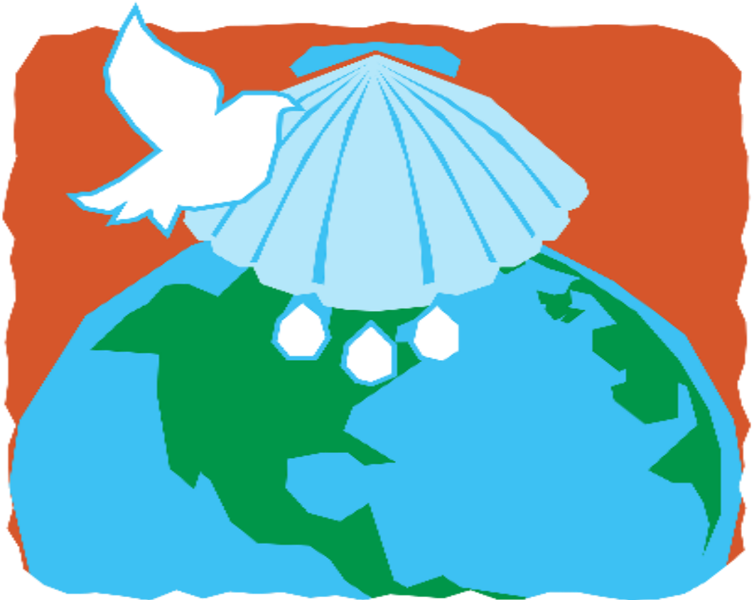
Image: "And the glory of the LORD shall be revealed, and all flesh shall see it together, for the mouth of the LORD has spoken." ( Isaiah 40:5 )