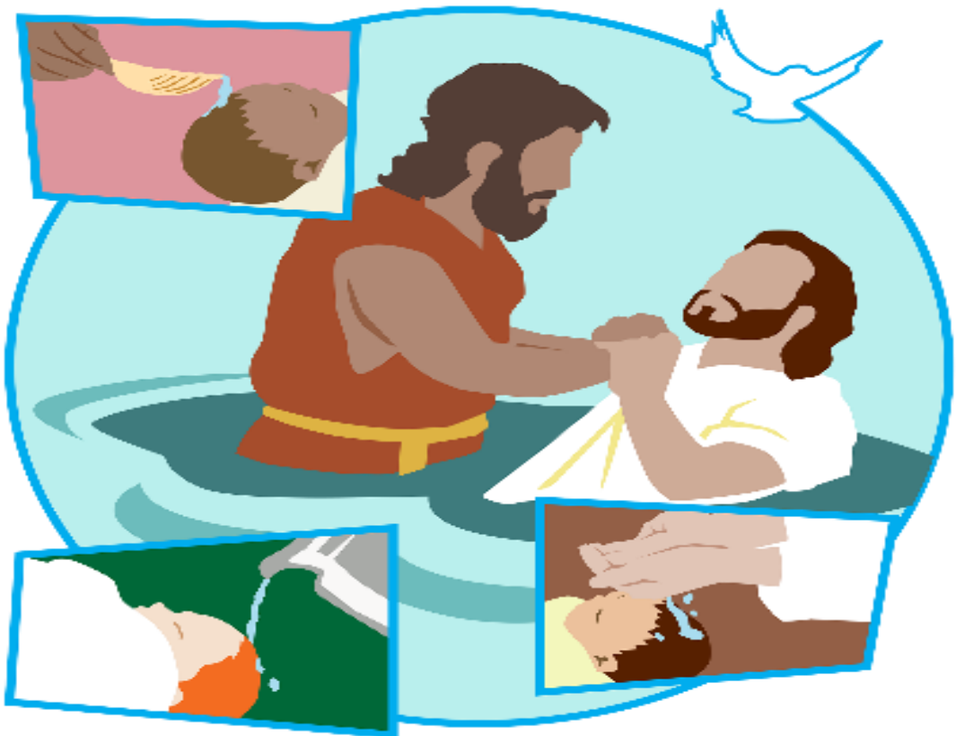
Image: "They asked him, "Then why are you baptizing, if you are neither the Christ, nor Elijah, nor the Prophet?" John answered them, "I baptize with water, but among you stands one you do not know, even . . . whose sandal I am not worthy to untie." (John 1:25-27)