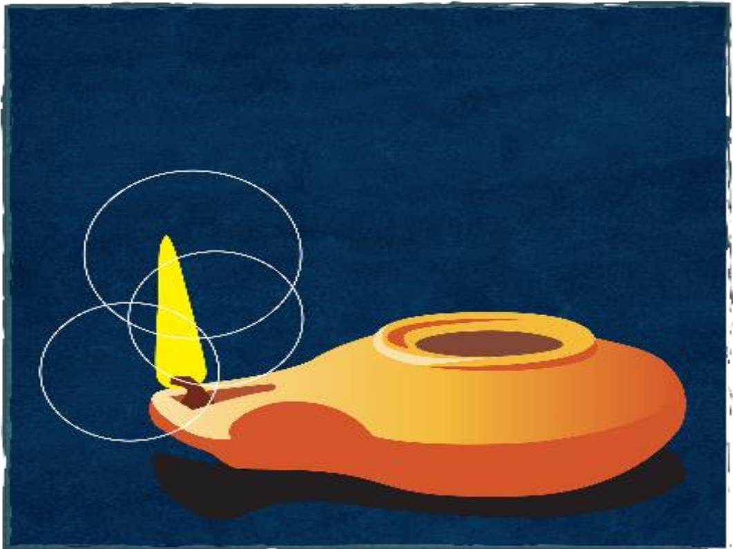
Image: "Stay dressed for action and keep your lamps burning, and be like men who are waiting for their master to come home from the wedding feast, so that they may open the door to him at once when he comes and knocks." (Luke 12:35-36)