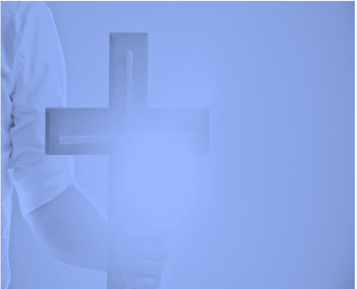
Image: "For we are his workmanship, created in Christ Jesus for good works, which God prepared beforehand, that we should walk in them." (Ephesians 2:10)