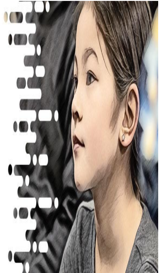
Image: "I am the vine; you are the branches. Whoever abides in me and I in him, he it is that bears much fruit, for apart from me you can do nothing." (John 15:5)

2024 CONNECTED NATIONAL LUTHERAN SCHOOLS WEEK