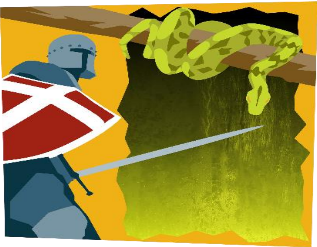
Image: "Put on the whole armor of God, that you may be able to stand against the schemes of the devil." (Ephesians 6:11)