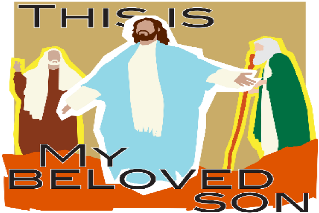
Image: “And after six days Jesus took with Him Peter and James and John, and led them up a high mountain by themselves. And He was transfigured before them, and His clothes became radiant, intensely white, as no one on earth could bleach them. And there appeared to them Elijah with Moses, and they were talking with Jesus. . . . And a cloud overshadowed them, and a voice came out of the cloud, “This is My beloved Son; listen to Him.” (Mark 9:2-4, 7)