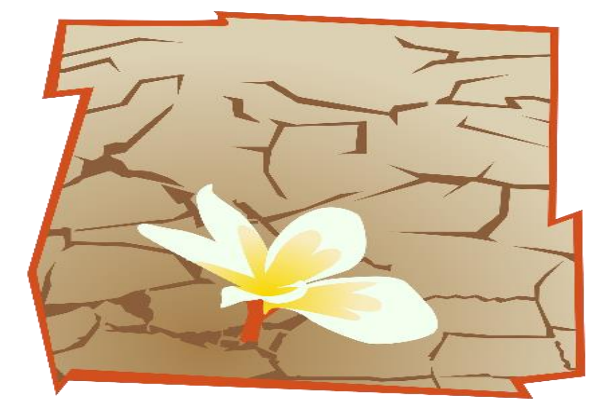
Image: "We rejoice in our sufferings, knowing that suffering produces endurance, and endurance produces character, and character produces hope, and hope does not put us to shame, because God's love has been poured into our hearts through the Holy Spirit who has been given to us." ( Romans 5:3-5)