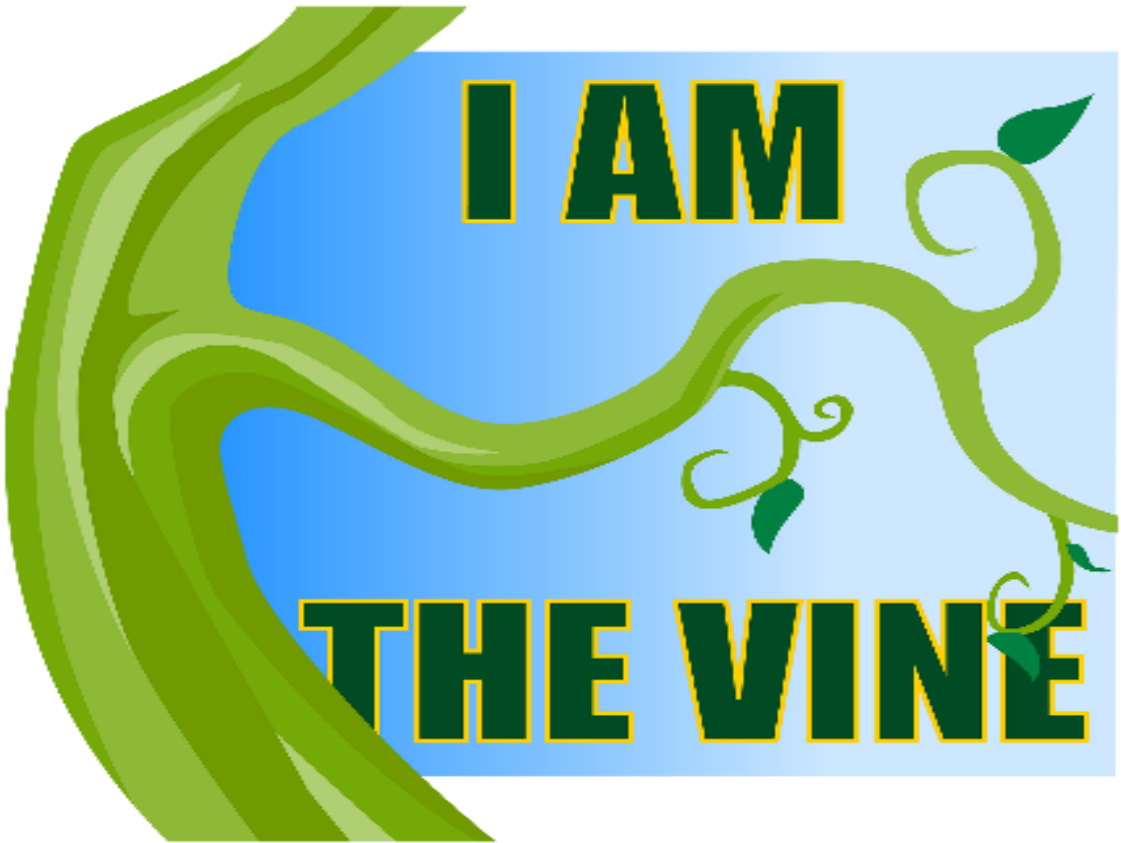
Image: “[Jesus said:] “I am the true vine, and My Father is the vinedresser. Every branch of Mine that does not bear fruit He takes away, and every branch that does bear fruit He prunes, that it may bear more fruit.” (John 15:1-2)