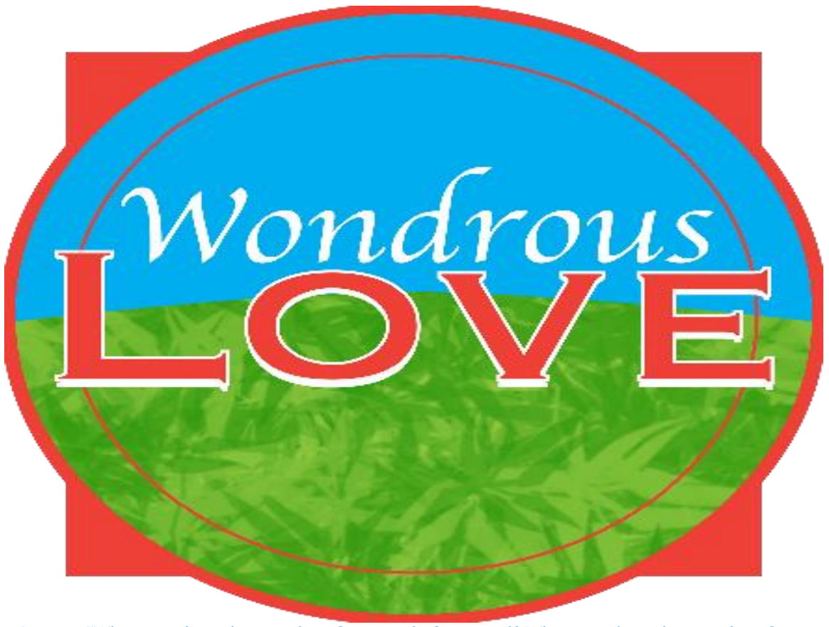
Image: "What wondrous love is this, O my soul, O my soul! What wondrous love is this, O my soul! What wondrous love is this That caused the Lord of bliss To bear the dreadful curse for my soul, for my soul, To bear the dreadful curse for my soul! (LSB 543:1)