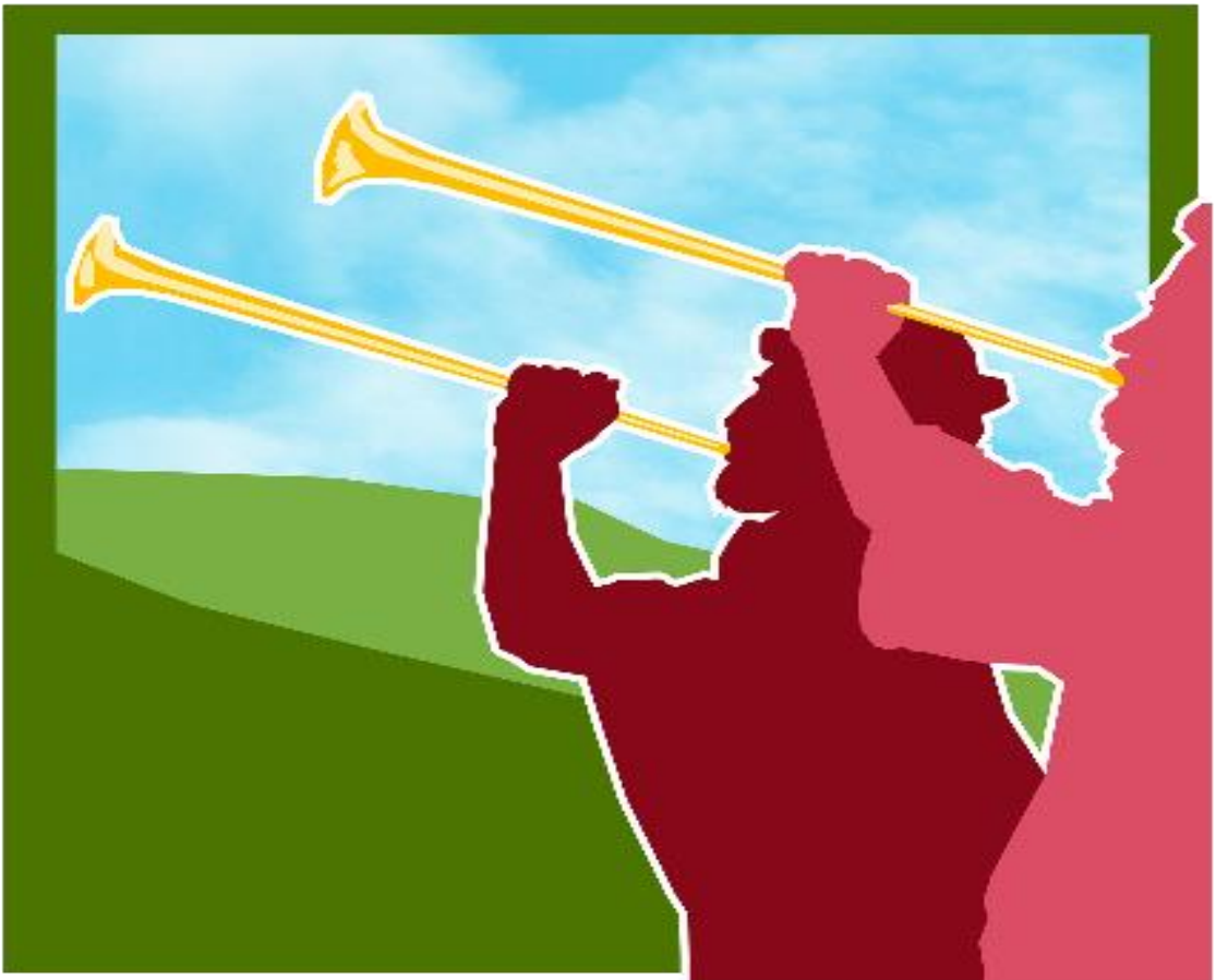
Image: "Rejoice! Rejoice! Emmanuel Shall come to thee, O Israel!" (LSB 357 Refrain)