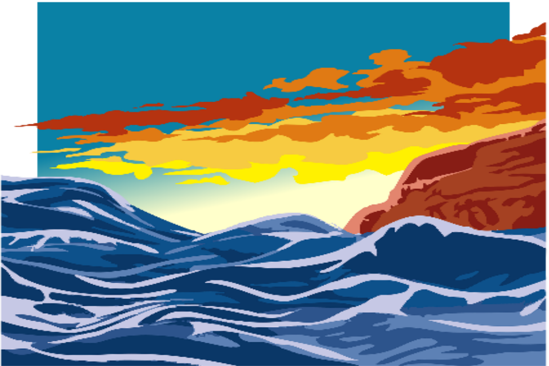
Image: "The people dwelling in darkness have seen a great light, and for those dwelling in the region and shadow of death, on them a light has dawned." ( Matthew 4:16 )