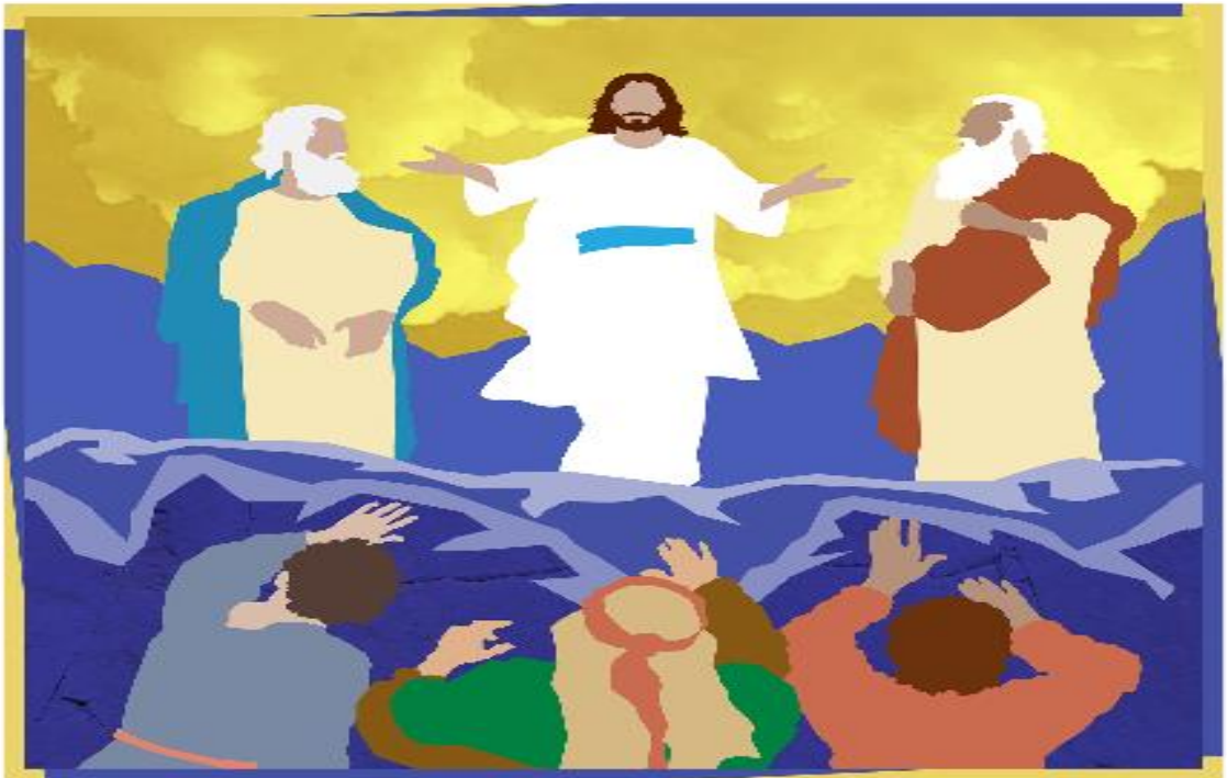
Image: "And He was transfigured before them, and His face shone like the sun, and His clothes became white as light. And behold, there appeared to them Moses and Elijah, talking with Him. . . . He was still speaking when, behold, a bright cloud overshadowed them, and a voice from the cloud said, "This is My beloved Son, with whom I am well pleased; listen to Him." When the disciples heard this, they fell on their faces and were terrified. But Jesus came and touched them, saying, "Rise, and have no fear." (Matthew 17:2-3, 5-7)