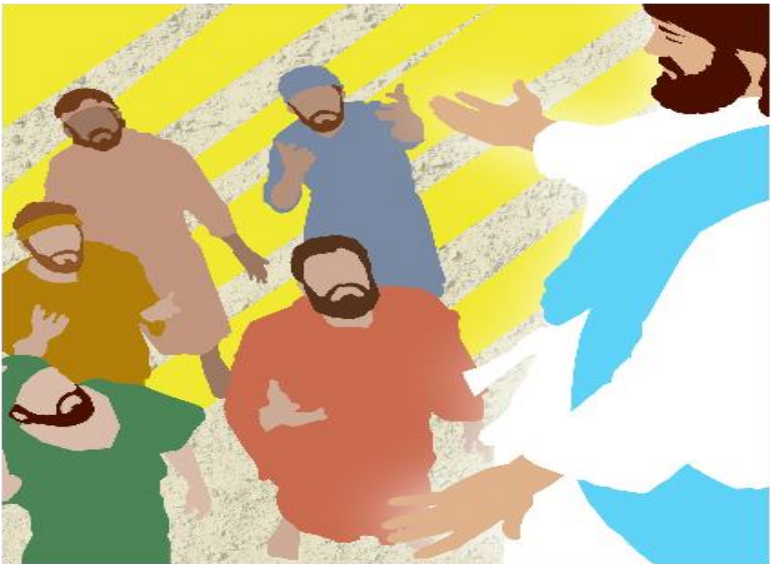
Image: "Since Christ returned to claim His throne, Great gifts for me obtaining, My heart will rest in Him alone, No other rest remaining; For where my treasure went before, There all my thoughts will ever soar To still their deepest yearning." (LSB 492:2)